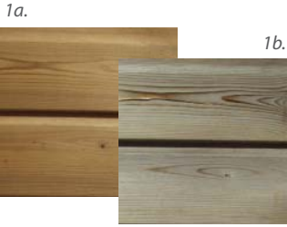
1a. Uncoated thermally modified wood surface. 1b. Uncoated thermally modified wood surface after 6 months outside.