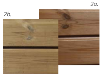
2a. Thermally modified wood surface with tinted wood oil. 2b. Thermally modified wood surface with tinted wood oil after 6 months outside.